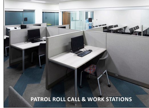
PATROL ROLL CALL & WORK STATIONS